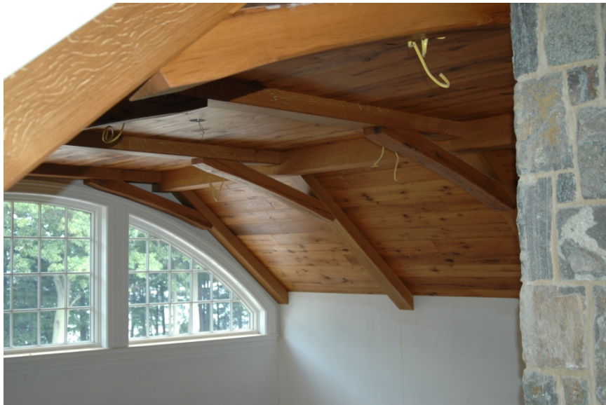
Timber frame ceiling of quarter-sawn oak