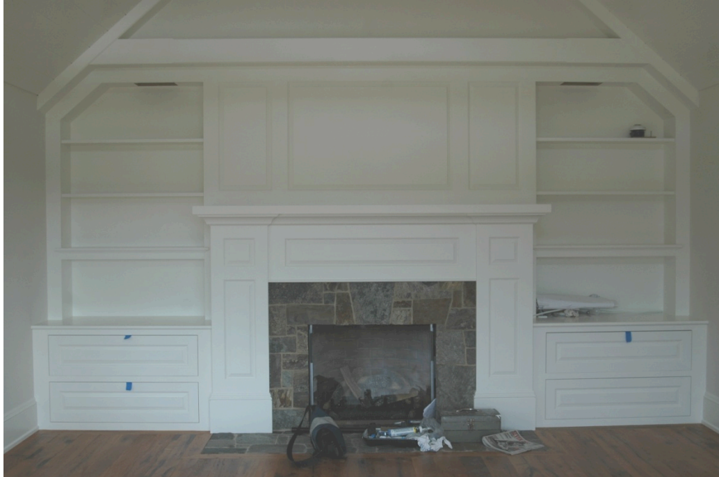
Master bedroom wall unit