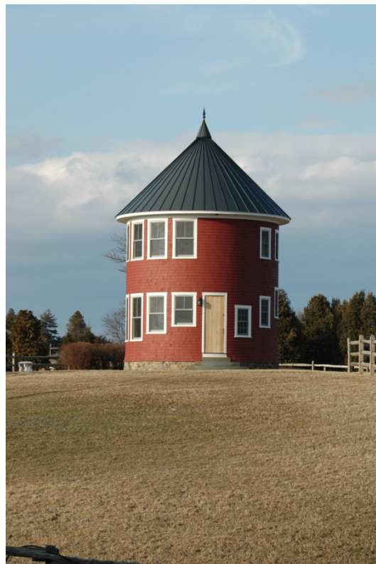
Quaker Smith Point, Shelburne Farms, VT