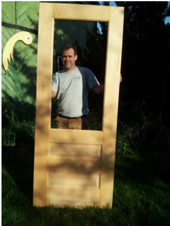
Vertical grain fir doors with glass