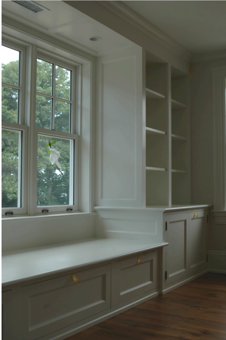
Built-in wall unit