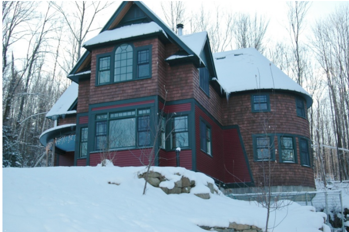
Burgess residence 2006