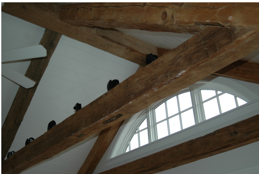
Barn beams incorporated into ceiling