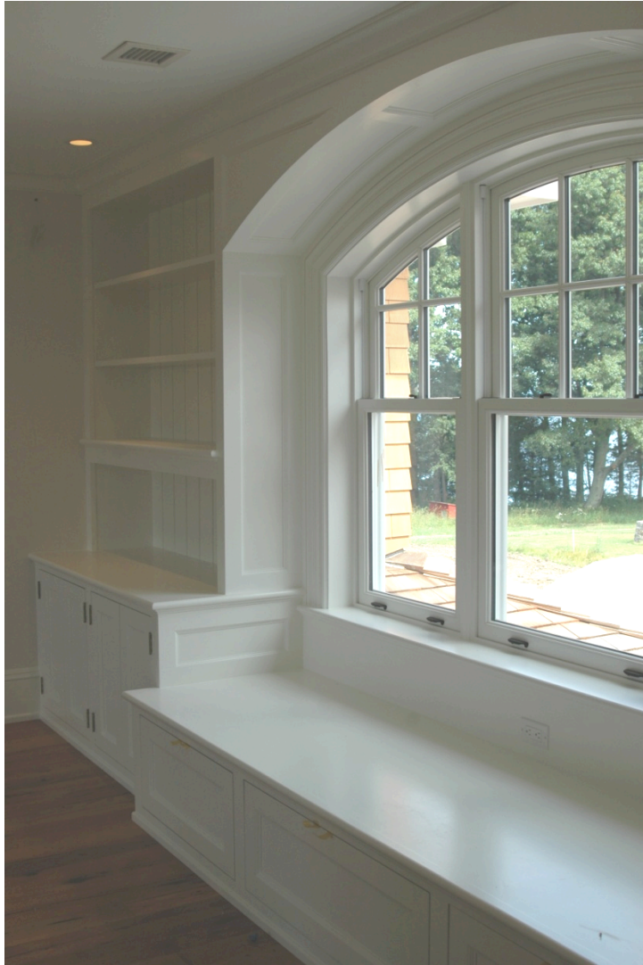
Arched window with window seat and shelves