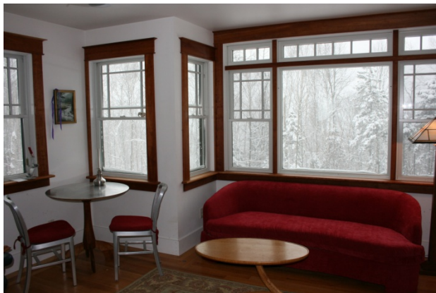
Window trim and tables