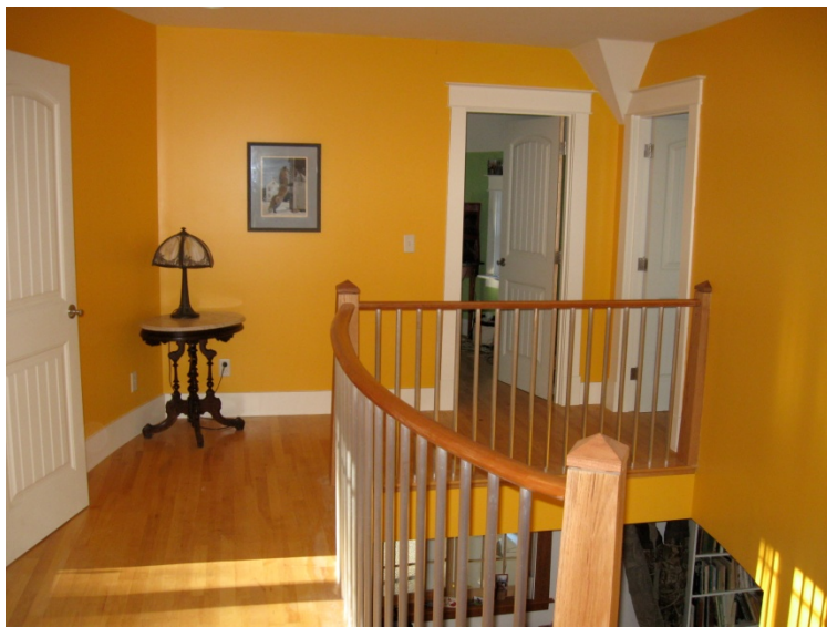
Curvilinear staircase in aluminum, oak and cherry